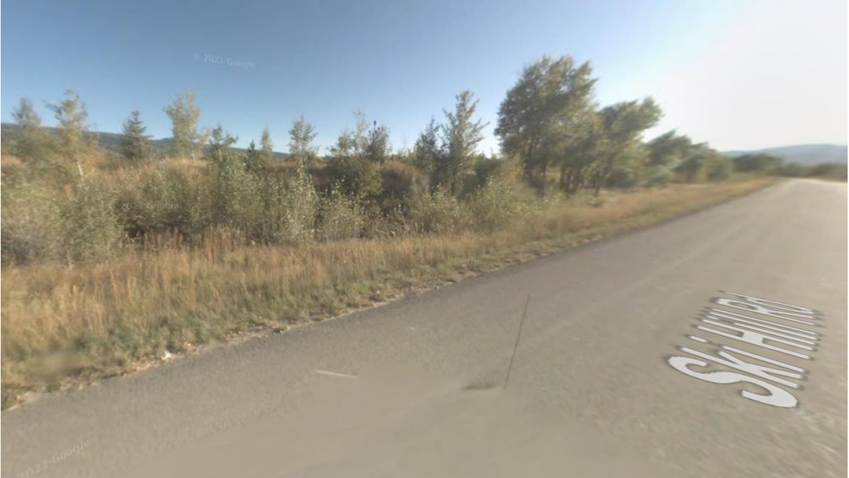
Fig. 4: Existing Landscaping dividing Ski Hill Road and the Proposed Development