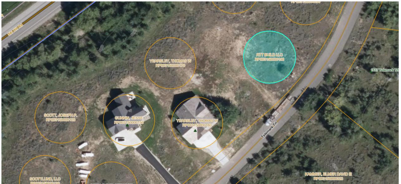
Fig. 2: Aerial Image