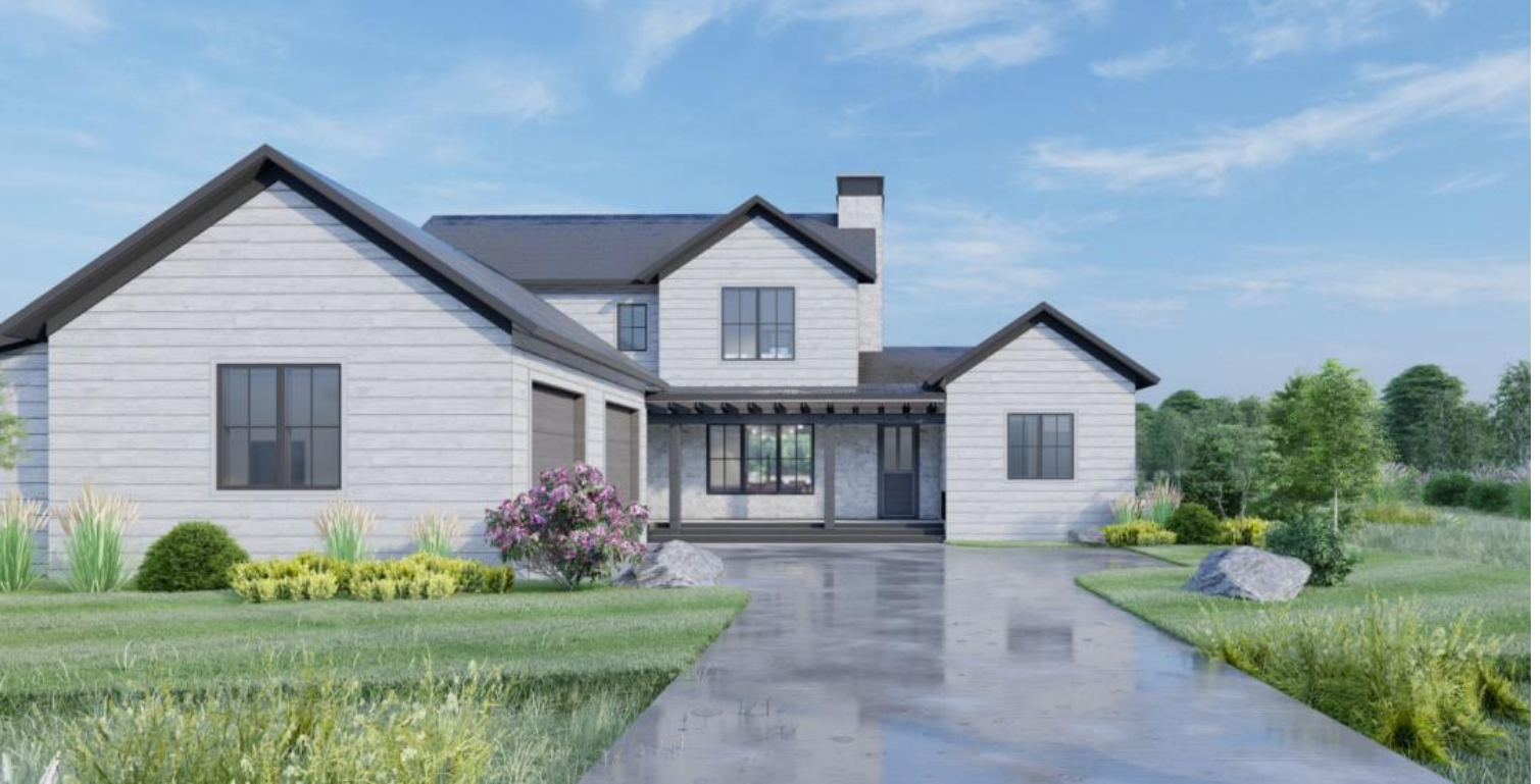
Fig. 8: Rendering of the Proposed Development