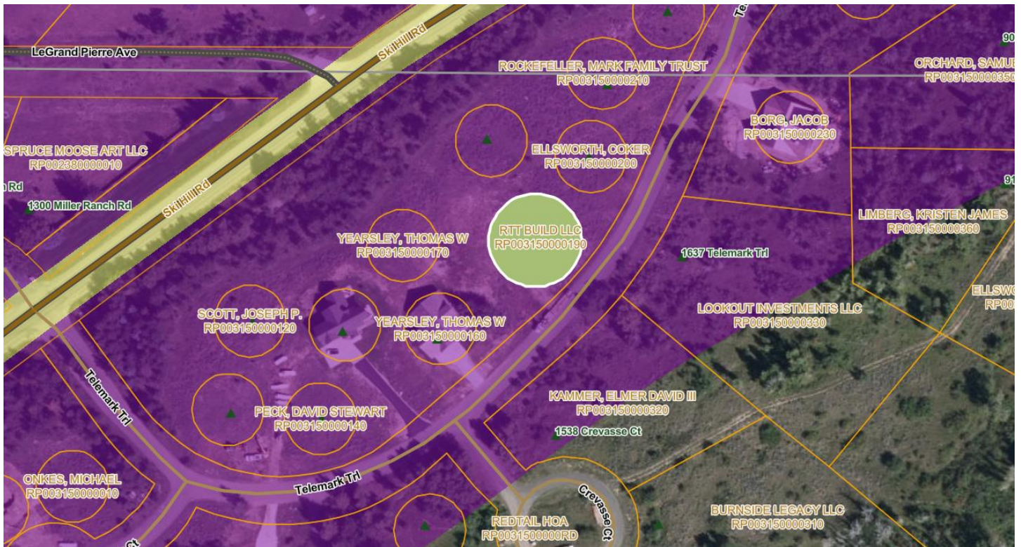
Fig. 3: Aerial Image; Scenic Corridor Overlay