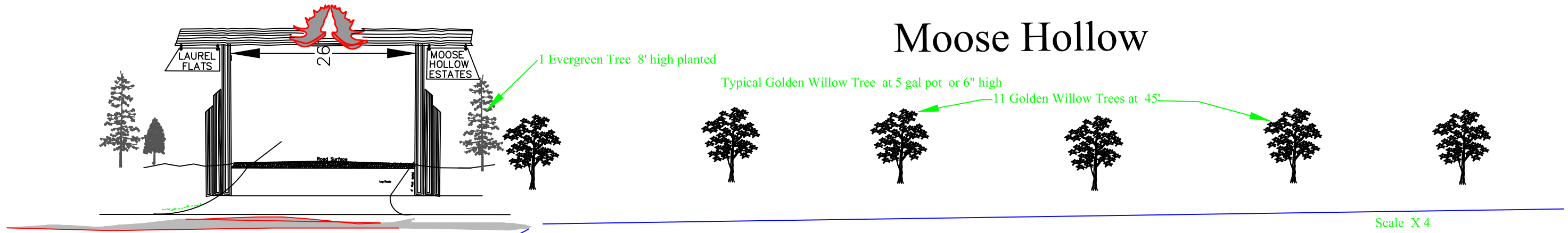
ENTRANCE SIGN AND LANDSCAPING