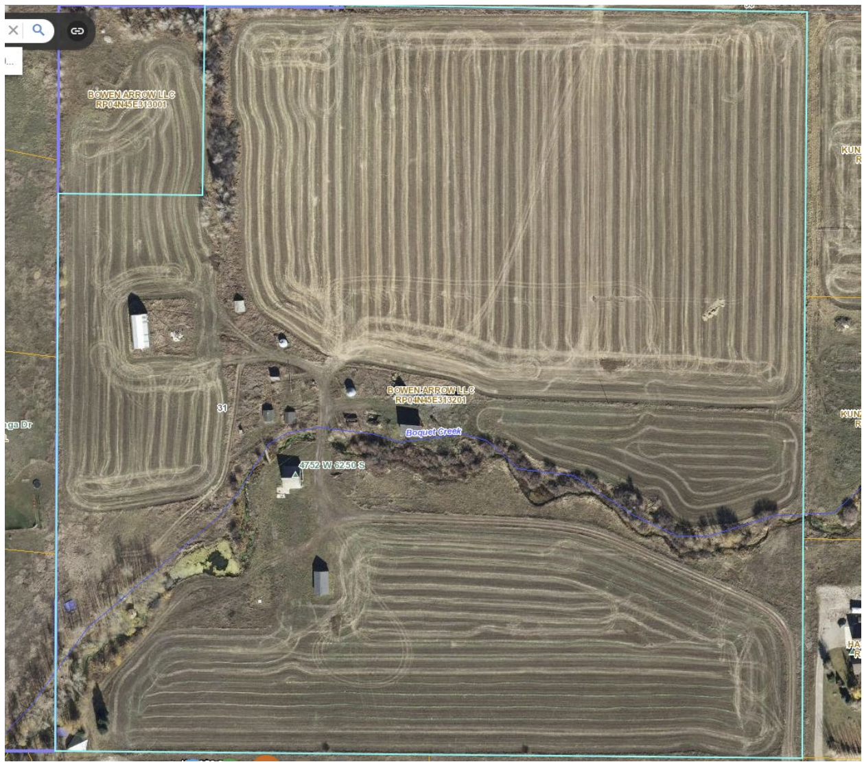
Figure 2. Aerial Image